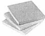
4 packs of sticky notes any size or color