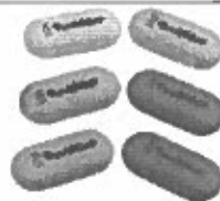
5 erasers (no pencil tops erasers)