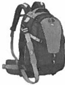
1 backpack for the child Please label with student name