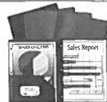
5 laminated two pocket-folders No names on them